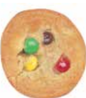
Rainbow Item #1205