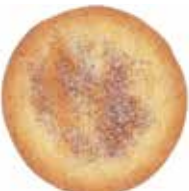
Snickerdoodle Item #1209