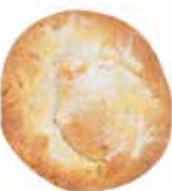
Sugar Item #1204