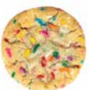
Birthday Cake Item #1211