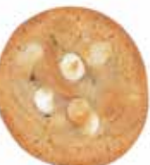
White Chocolate Macadamia Nut Item #1206