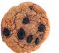
Oatmeal Raisin Item #1203