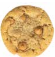
Salted Caramel Item #1210