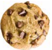
Chunky Chocolate Chip Item #1201